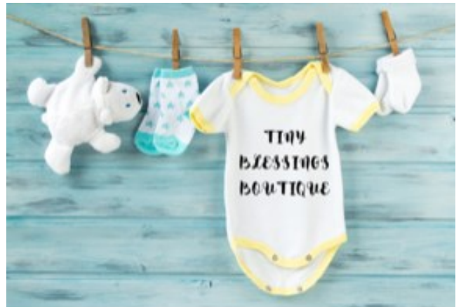
All are welcome!! Open by appointment only "Arlington FM's Tiny Blessings Boutique" on Facebook Email questions: office@arlingtonfm.com